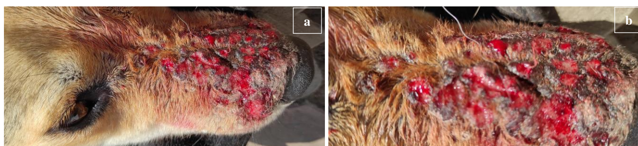
Figure 1. Clinical characteristics of canine facial discoid lupus erythematosus in a German Shepherd dog. a: Erythematous, depigmented, ulcerated, and crusted nasal lesions of facial; b: Complete loss of cobblestone appearance is visible (magnification 2.5)

The dorsal nasal region was affected by partial baldness and consolidating annular to polycyclic, hyperpigmented plaques with fine silvery scaling (Figure 1 a). The central part of hyperpigmented lesions started to lose the normal skin texture. On the other hand, early skin lesions in canine FDLE typically involve scaling, depigmentation, and erythema, which then progress to erosions and ulcers that result in atrophy and loss of the nasal planum's structure (Figure 1 b). Crusting can occur when there is damage to epithelial integrity. Moreover, skin lesions can have an effect on the nasal planum. Starting from day 5, there was a gradual decrease in hyperemia of the wound and skin around the wound, itching, and pain reaction. From day 10 of treatment, a gradual epithelization of the wounds took place. Complete tissue regeneration was seen on day 30 (Figure 2).