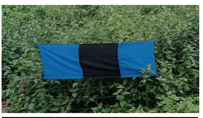
Figure 2 - A 150 cm length × 50 cm width screen.

The insecticide used for the treatment of screens was deltamethrin (DECTROL EC 50; MEDIVET). In the field, the insecticide solution was prepared by diluting 5ml of