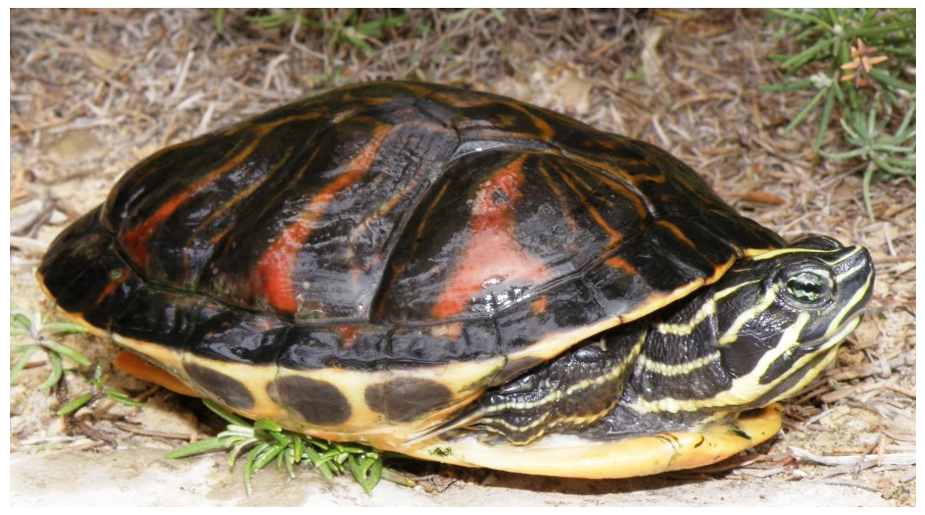
Figure 1. Florida Red-bellied Turtle Pseudemys nelsoni (P. nelsoni Carr, 1938).

dietary carotenoid access of Emydid turtles have been relatively unstudied and to date, no research has been done to document objectively the changes in plastron color of captive-reared P. nelsoni . It is interesting to see how aspects of health can interact with the exogenous provision of carotenoids. Therefore, the current study aimed to investigate if color plastron in P. nelsoni is correlated to size (interpreted as age) and gender, however also to FA, among captive animals.