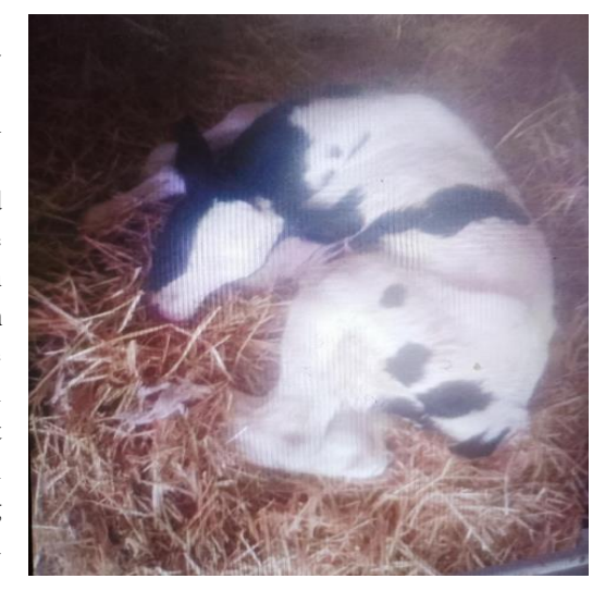
Figure 3. A two day old recumbent calf

A sepsis calf undergoes many physiological abnormalities, resulting in compromised body homeostasis, uncontrolled