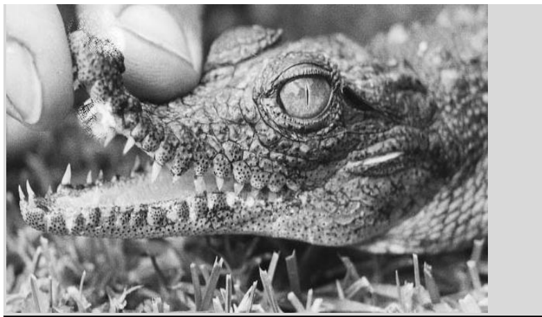
Figure 3 - 'Rubber jaws' and 'glassy teeth' in a Nile crocodile hatchling with osteomalacia.

Feeding frozen fish has two limitations; the first is that fresh and frozen fish often contain large amounts of the enzymes thiaminases. Freezing appears to increase the concentration of the thiaminases in the tissue of fish, which destroys the vitamin B_1 (thiamine); the second problem is an accumulation of fats in the subcutaneous and intramuscular tissue leading to paralysis of the legs, which is caused by particularly oily fish meals (Huchzermeyer, 2002; Huchzermeyer, 2003). For the treatment of nutritional bone disease, it is necessary to rectify the diagnosed deficiency, usually that of calcium. If the affected hatchlings are too weak to feed by themselves, they can initially be dosed or injected intraperitoneal (IP) with calcium borogluconate (250 mg/ml), at a dosage of 1.5ml/kg body mass. The corrected ration should contain additional calcium carbonate, dicalcium phosphate, or sterilized bone meal, to give a final composition containing 1.5–2% calcium and a Ca:P ratio of 1.5:1 (Huchzermeyer, 2003).