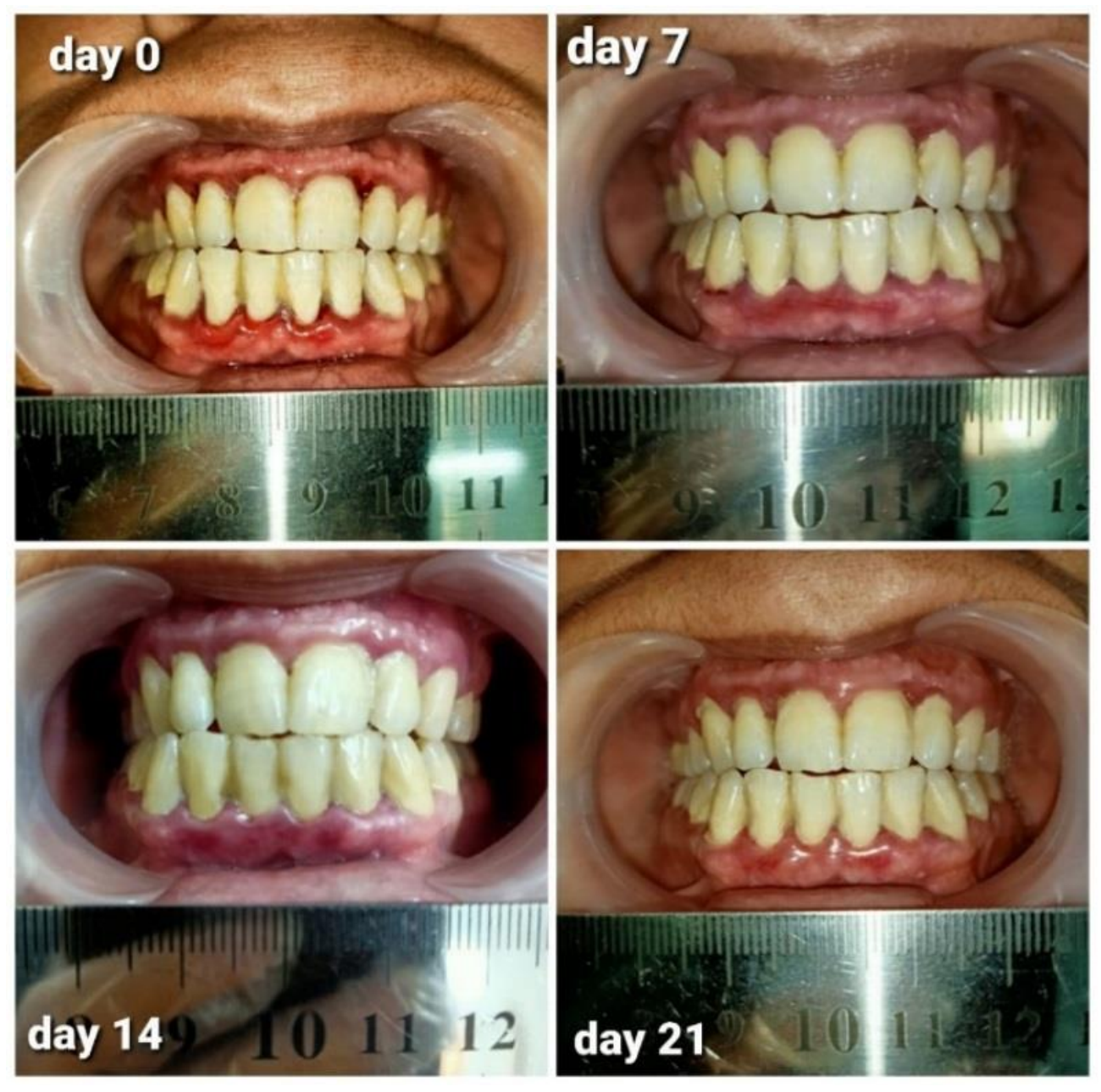
Figure 1. Wound healing by time from day 0 to day 21 on control group.