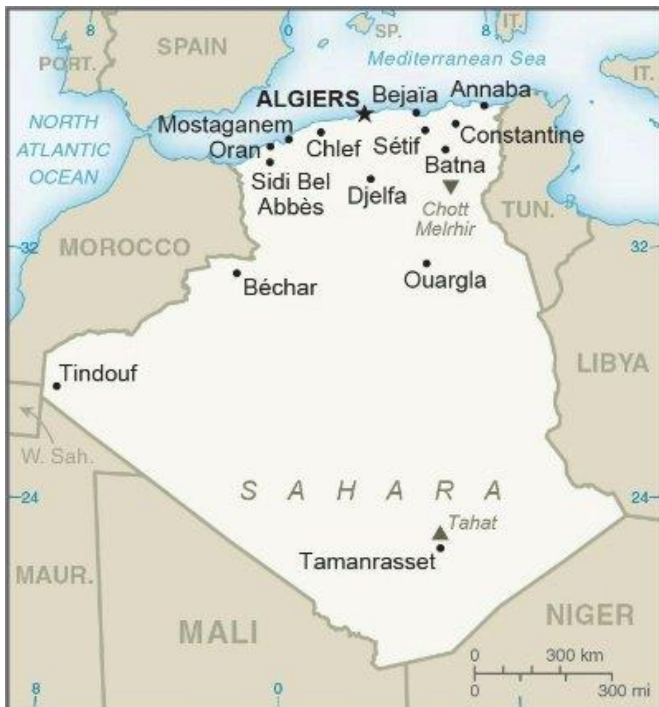
Figure 1A. General map of Algeria ( http://www.state.gov/p/nea/ci/ag/ )

Because of the absence of pathognomonic symptoms, the diagnosis of brucellosis requires laboratory tests. Bacteriological culture is cumbersome and dangerous, but serological tests are routinely used. However, there is a bewildering list of serological tests (Ducrotoy et al., 2016), and most new developments are focused on tests suitable for surveillance of large numbers of animals in Brucella -free areas that require conditions not met in resource-limited settings (McGiven, 2013; Ducrotoy et al., 2015). Thus, a second aim of the present work was to compare apparent prevalence figures obtained with simple RBT, more sophisticated and highly-sensitive tests like indirect ELISA (iELISA) with tests of higher specificity that also differ in the degree of sophistication (CFT and double gel diffusion (DDG) with smooth-lipopolysaccharide (S-LPS) and native hapten polysaccharide (NH).