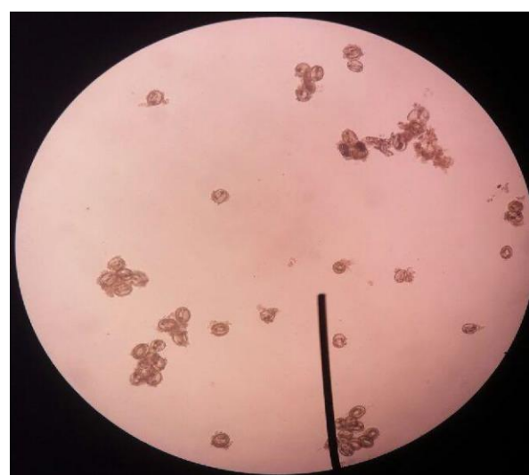
Figure 4. L2 Toxocara vitulorum (100× magnification).