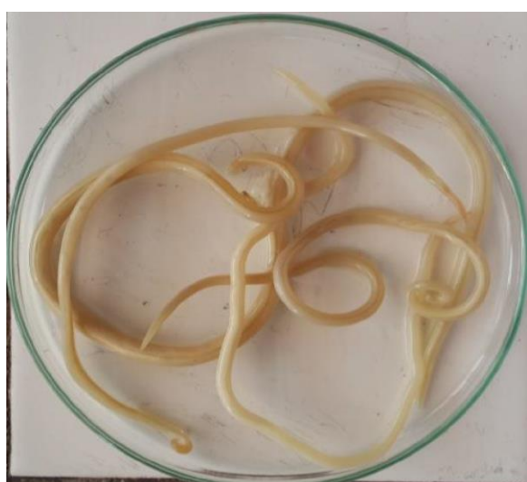
Figure 3. Adult Toxocara vitulorum worms