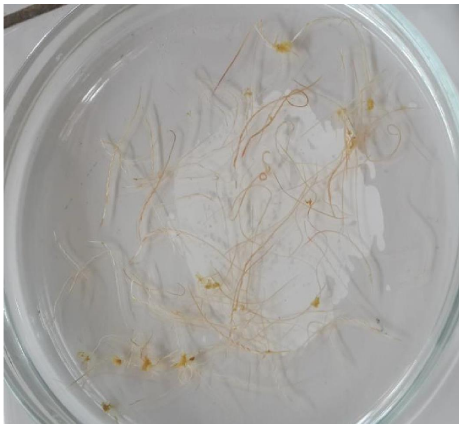
Figure 1. Adult stage of Haemonchus contortus

The basic principle of the Western blot technique is to separate proteins by SDS-PAGE, then transfer the proteins to the appropriate nitrocellulose membrane, followed by labeling the proteins with antibodies and visualizing them by the desired coloring, such as coomassie blue (Slifka and Amanna, 2019). Cross-reactions occurred between H. contortus protein and anti-L2 T. vitulorum serum on BM 141.3, 81.3, 64.6, 51.3, 46.8, and 38 kDa. The presence of a cross-reaction indicated that the protein is not a good diagnostic agent for haemonchosis because it causes false positives with diagnostic Toxocariasis.