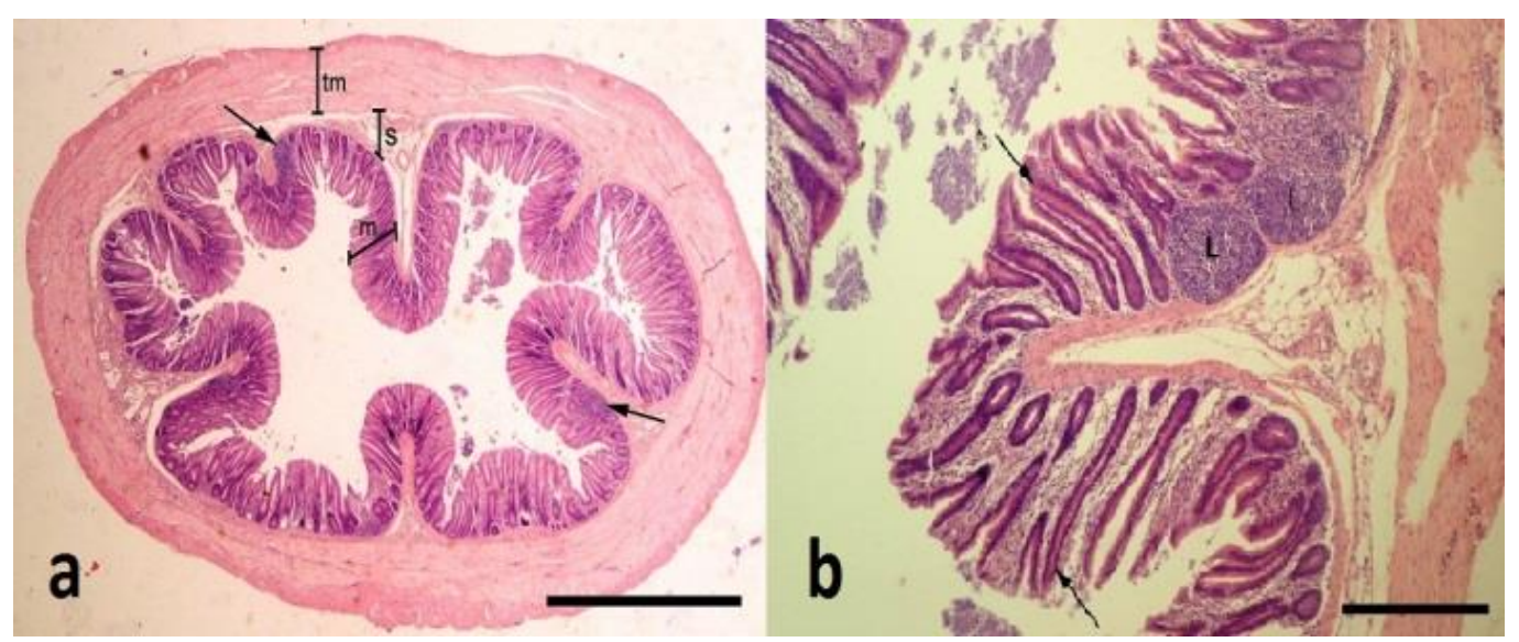
Figure 1 . a ) General view of the cecum in the experimental group of broiler chickens after 42 days of rearing period, 4x.Arrows: Lymph follicles, tm: tunica muscularis, s: submucosa, m: mucosa. Haematoxylin and eosin stain (H&E) Bar: 1000 \mu m; b ) Cecum of the experimental group, 10x. Arrows: Crypt, L: lymph follicles. H&E. Bar: 200 \mu m.