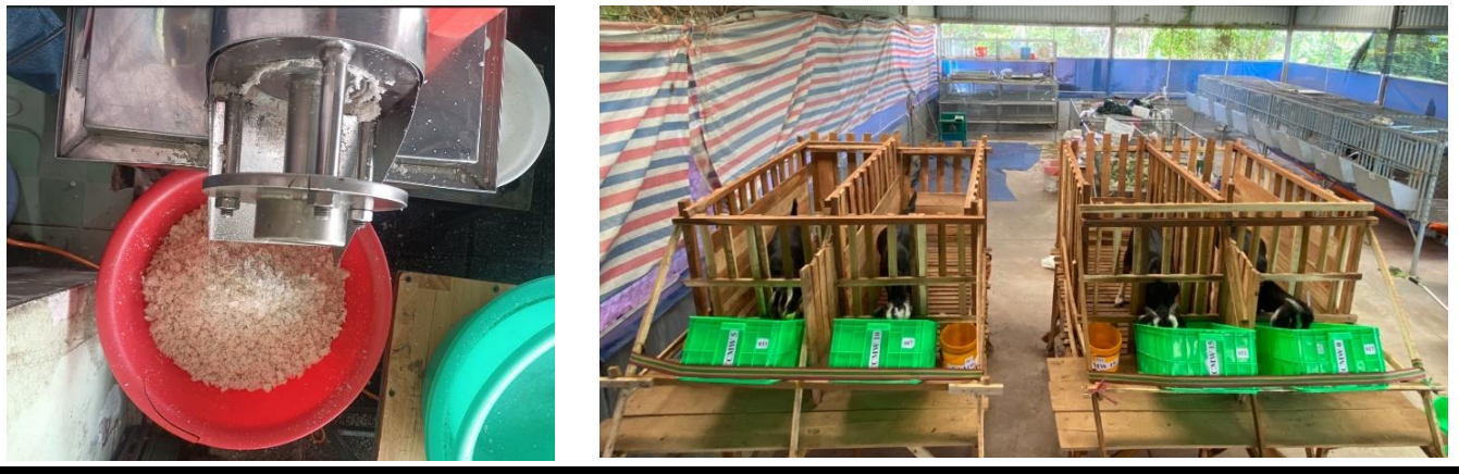
Figure 1 - Coconut meat waste preparation.

Four male Bach Thao goats (16.2±2.93 kg) used in this study. The processing methods (experimantal desing) are applied according to the Latin Square design (4x4) with the period of 2 weeks for adaptation and 1 week for data collection. The four treatments were supplement coconut meat waste at 0%, 5%, 10% and 15% dry matter. The coconut meat waste, Bach Thao goats and compositions of diets are shown in Figure 1 and 2 and also in Tables 1. The premix accounted for 2.0% of the feed supplement from rice distillers' by-products and coconut meat waste. The cabbage waste ratio for roughage was 35% of forages. The rice distillers' by-products, coconut meat waste, cabbage waste, and Operculia turpethum vines were purchased, harvested and cut down around Long Xuyen town, An Giang prefecture, Vietnam.