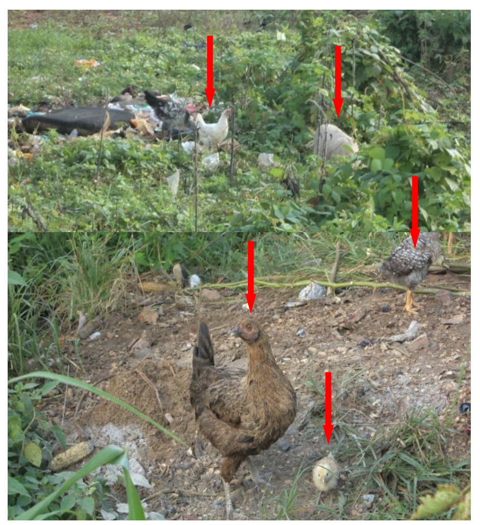
Figure 4. Rural poultry (red arrows) on free range with other animals scavenging in refuse dumpsites in a rural community in Olamaboro local government area, Kogi State, Nigeria