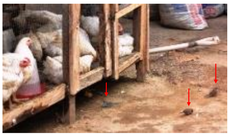
Figure 3. Broilers reared in a wooden cage with wild birds (red arrows) scavenging on spillage feed in a backyard poultry farm located in Kabba in Kabba/Bunu local government area, Kogi State, Nigeria