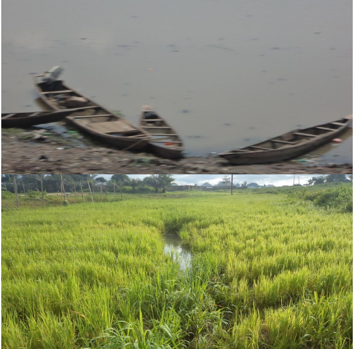
Figure 6. The convergence of two major rivers, Benue and Niger at Lokoja to form a confluence (A). Marshy wetland used for rice farming in Ajaokuta local government area (B), Kogi State, Nigeria