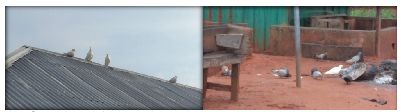
Figure 5. Domesticated and free flying wild pigeons flocking together around a household in Okenwe in Okene local government area, Kogi State