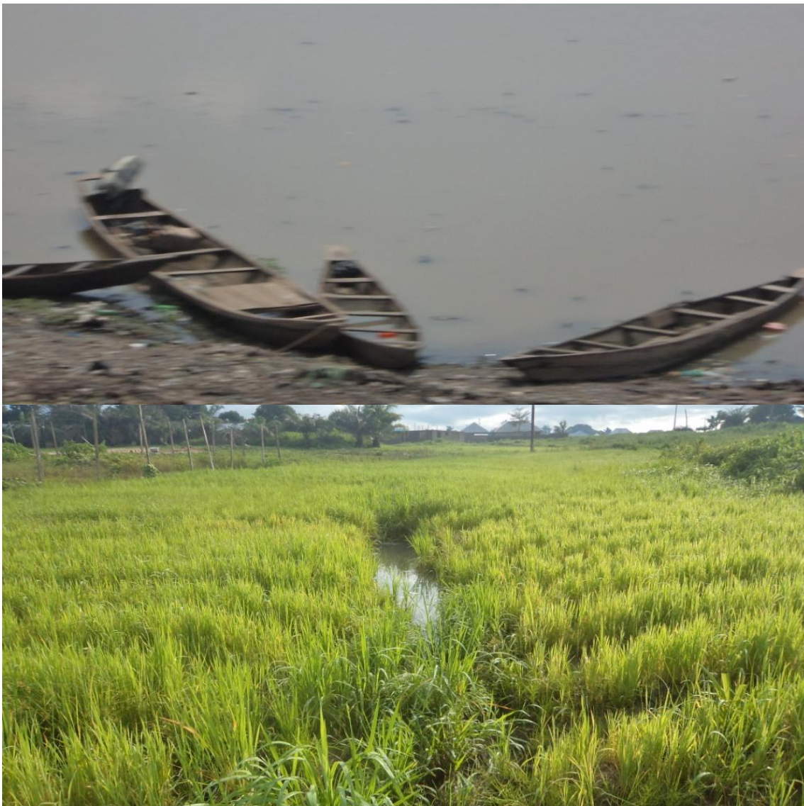
Figure 6. The convergence of two major rivers, Benue and Niger at Lokoja to form a confluence (A). Marshy wetland used for rice farming in Ajaokuta local government area (B), Kogi State, Nigeria