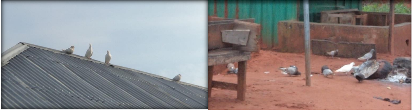
Figure 5. Domesticated and free flying wild pigeons flocking together around a household in Okenwe in Okene local government area, Kogi State