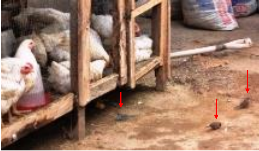
Figure 3. Broilers reared in a wooden cage with wild birds (red arrows) scavenging on spillage feed in a backyard poultry farm located in Kabba in Kabba/Bunu local government area, Kogi State, Nigeria