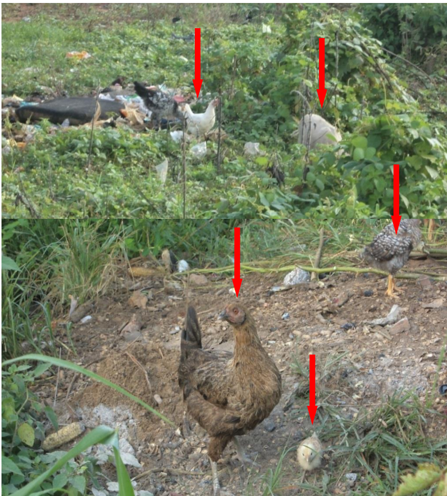
Figure 4. Rural poultry (red arrows) on free range with other animals scavenging in refuse dumpsites in a rural community in Olamaboro local government area, Kogi State, Nigeria