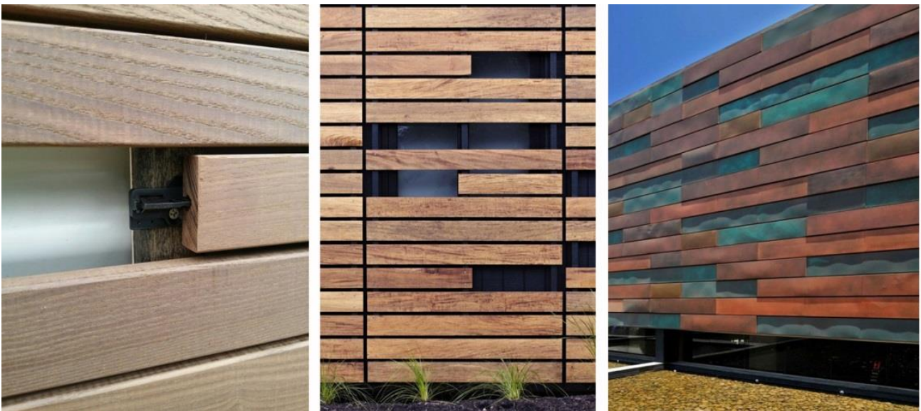
Figure 1. Accoya wood

Accoya wood uses much less energy in its production and use compared to other building materials such as cement, glass and aluminum. Compared to other materials such as aluminum, PVC and tropical hardwood (tropical hardwood from unstable forests supply). The Accoya leaves emit less greenhouse gas emissions. Accoya wood is more durable compared to wood such as Spruce and Red Meranti tropical hardwood, which are used as construction materials. The price of Accoya wood is more economical due to its unique features compared to the wood.