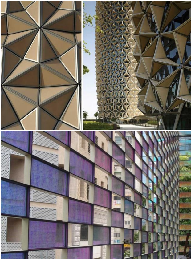
Figure 4: An example of the use of smart glasses

refrigeration, the high degree of colour variation, environmental comfort, washing ability, lack of smell and sensitivity, non-cracking, resistance to weathering, anti-static properties, applicability On all types of sub-work, high speed performance, fast and easy repair, fire-retardant, reduced reflection of light, lifespan of high-volume sound (textured surface). Cellulose coating properties is a very good insulating layer for reducing noise disturbance and preventing reflection of sound waves. It is remarkably (30% to 50%), which means the environment is acoustic. Lightweight (the weight of this coating is 400-700 gr/m), which is much lighter than gypsum weight and colour per square meter (17kg to 25kg), which reduces the weight of our stomach.