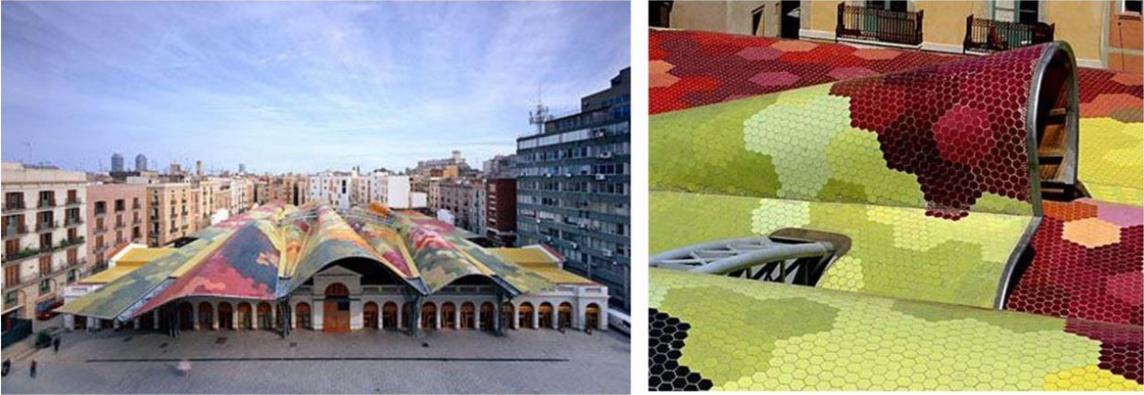
Figure 3: Shape shell composite

sense of inviting. Shapeshel is made with 3D CNC and is lightweight. It is resistant to chemical shock and chemical, and it is non-conductive. Another advantage of this material is its anti-flammability certificate in construction facades and full color rendering of this material.