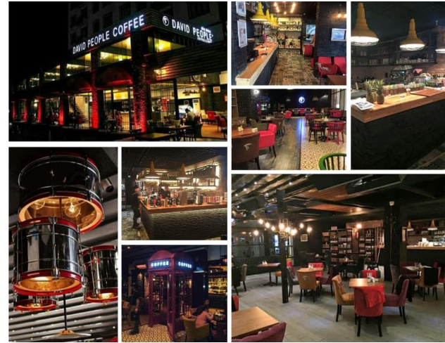
Figure 4. Interior views of cafe no. 3

This branch, which started to serve in Mardin after its interior design implementation was completed in 2014, consists of two floors, the ground and the 1st floor (Figure 1). The venue has a capacity of approximately 150 people. The red telephone booth, which was used as the main entrance gate in other branches, was obviously employed here, too. The ground floor of the cafe includes production and preparation, service, seating and common areas while on the upper floor, sitting areas that can serve different purposes were created. Thus, different opportunities have been determined for work, activity, meeting, service or socialization areas.