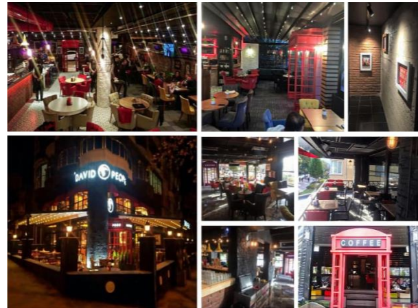
Figure 2. Interior views of cafe no. 1

This branch, which offers snacks and beverages to its users, is in service in Isparta and was completed in 2013. The user capacity of the place is approximately 140 people. The space consists of two floors, the ground and the first floor (Figure 1). The space is entered through a door in the form of a red telephone booth, which is an imagery of the corporate image of the cafe. The main volume is located on the ground floor while the upper floor is mostly used for sit-ins. The interior has a flexible design that offers people the chance to choose where and how they spend their time and offers opportunities in different positions, sitting styles and privacy rates.