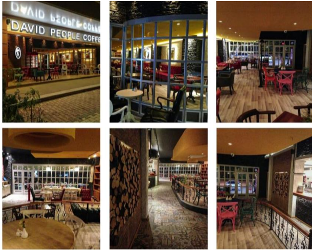
Figure 3. Interior views of cafe no. 2

The use of red and yellow tones as warm colours in the space has created an exciting and stimulating effect. Neutral colours used in the space assemble a passive, calming and introverted effect. Parquet was preferred as the floor covering in the living areas that are customized with elevation differences. Parquet material slips, falls, etc. minimizes situations and absorbs sound. Paint, wallpaper and brick cladding on the walls, wood on the tables, and fabric on the seating elements were favoured. In the space where tables for two and four people are concentrated, there is also a group table that can allow the use of more people. The connection was set between the concept of the place and the elements that make up the identity of the place, such as the logo, name, motto, colour and menu design (Figure 3).