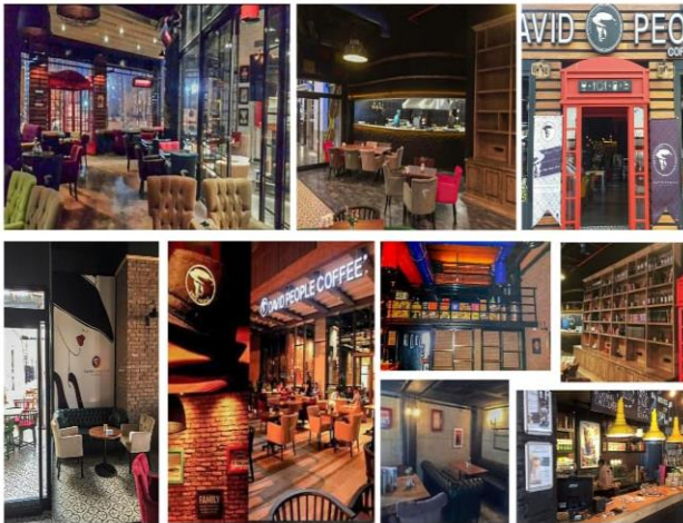
Figure 5. Interior views of cafe no. 4.

It is noteworthy that red and yellow are dominant throughout the place. In the materials used in the space, ceramics on the floor, paint, wallpaper and brick coating on the wall, wood on the tables and fabric in the seating element coverings are preferred. Warm, cold and neutral colours are utilized together in the living areas. The soft texture of the fabric used in the seating items makes the user feel comfier. The corporate identity of the place was supported by the selected materials, colours, logo and accessories (Figure 5). Table 1 demonstrates the analysis of the comparative interior components of the cafe branches described in detail above. Accordingly, the comparisons of spaces over the titles of color, light, texture, material and form are interpreted in detail.