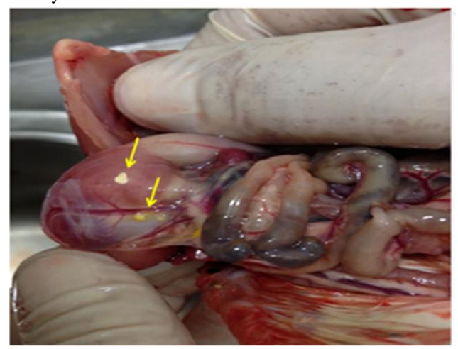
Figure 5. White-yellowish caseous nodules on the outer surface of the gizzard.